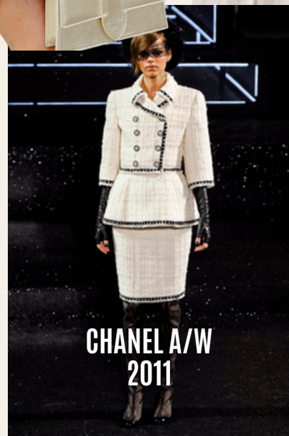
CHANEL A/W 2011