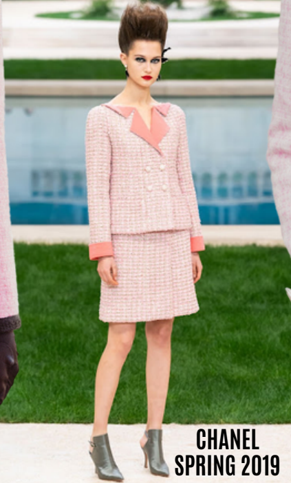
CHANEL SPRING 2019