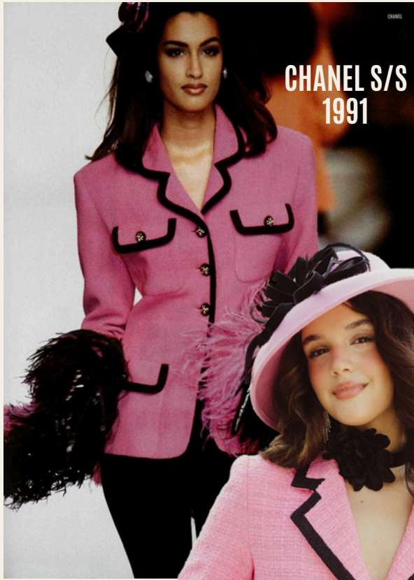
CHANEL S/S 1991