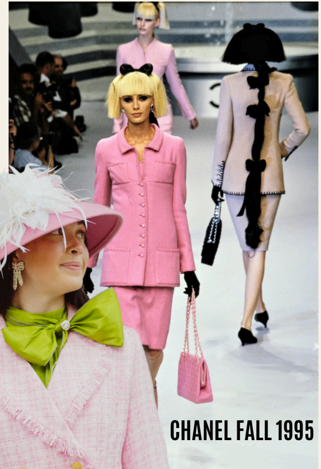
CHANEL FALL 1995

LONGER, MORE ACCENTUATED JACKETS BECAME POPULAR IN THE 1980S