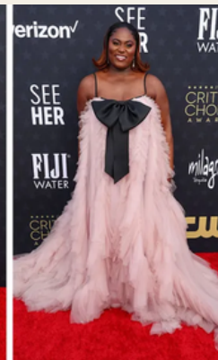
CELEBRITIES ON THE RED CARPET