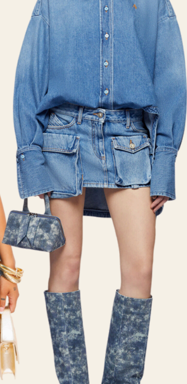
THE ATTICO DENIM MINI SKIRT $840