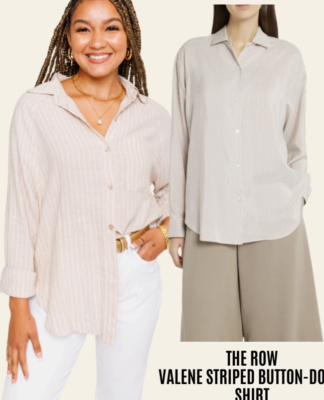
THE ROW VALENE STRIPED BUTTON-DOWN SHIRT $1,450