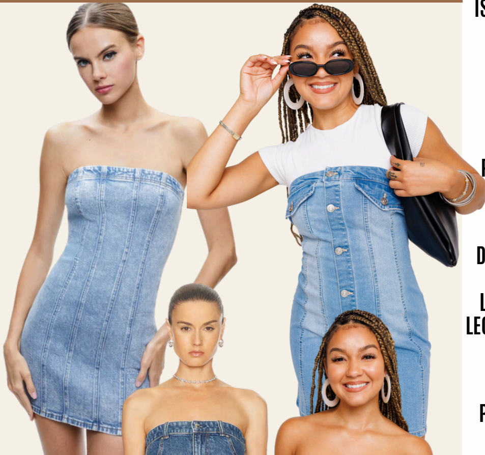
ALICE + OLIVIA $350