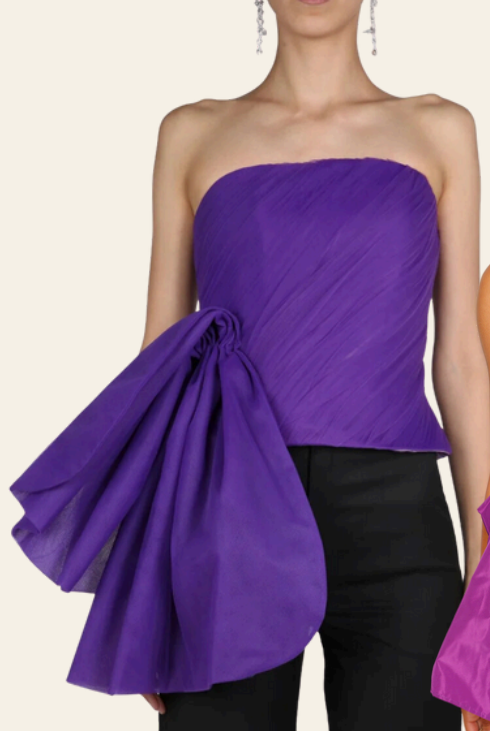
ANOQUI BOW DETAILED STRAPLESS TOP $590