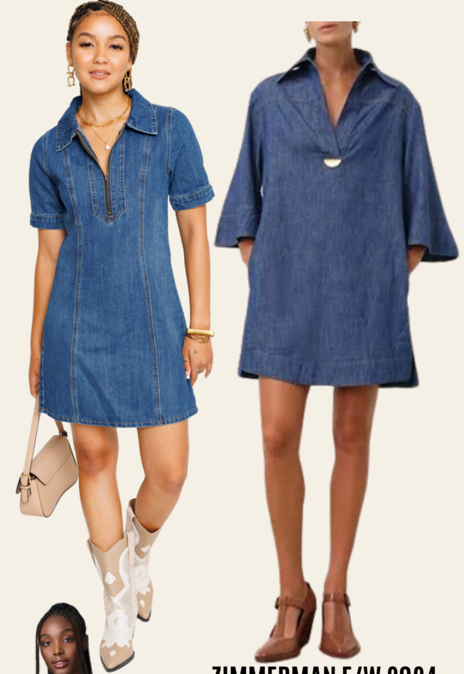
ZIMMERMAN F/W 2024 $615

JEANS AS “OCCASIONWEAR” - AS LONG AS THE LOOK IS ELEVATED: DENIM DRESSES, FLARED DENIM WITH DRESSY TOP, PAIR DRESSES WITH A HEEL