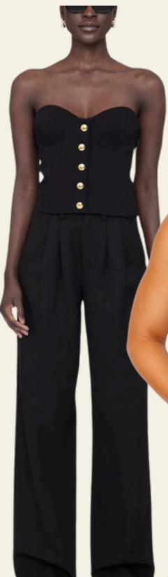
ANNIE BING FALL '24 $300