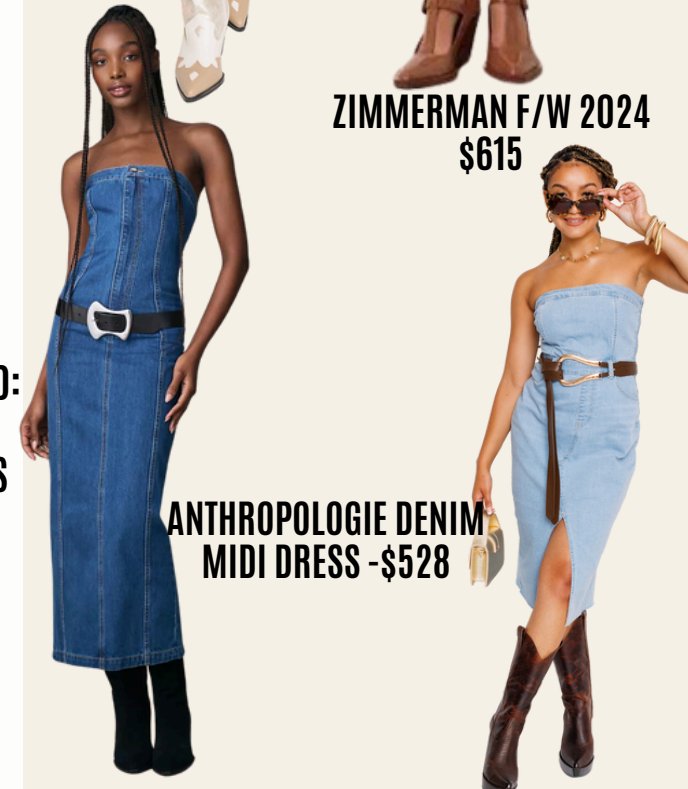
ANTHROPOLOGIE DENIM MIDI DRESS -$528