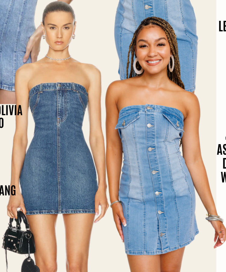
ALEXANDER WANG $495