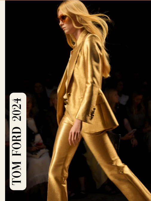
TOM FORD 2024