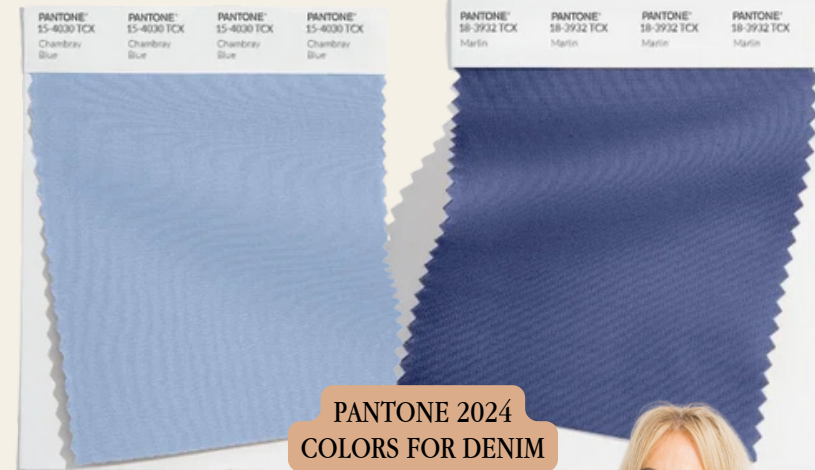
PANTONE 2024 COLORS FOR DENIM